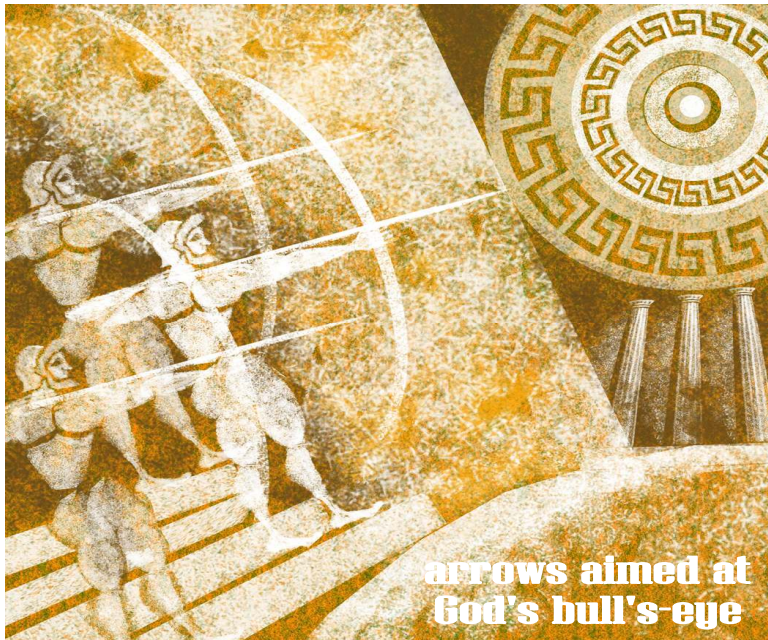
arrows aimed at God's bull's-eye